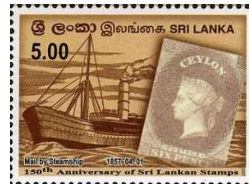
Ceylon – Sri Lanka