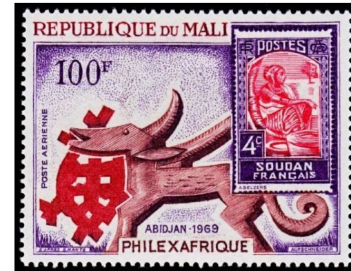
Francia Szudán – Mali