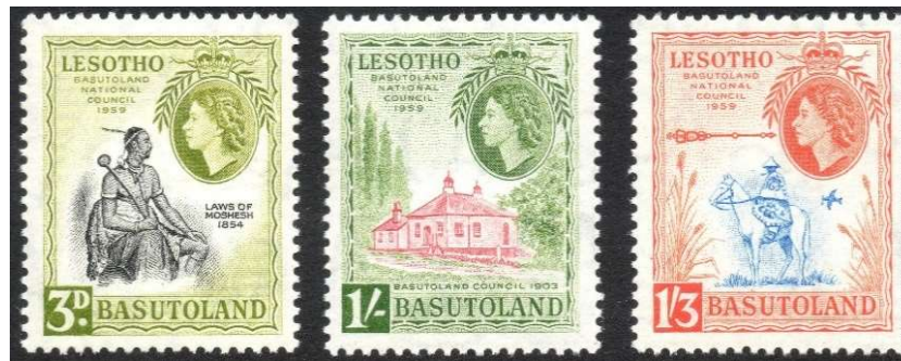
Basutó föld – Lesotho