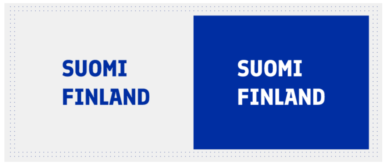
Figure 6: The English name of the county (or the name in the language of the target country) is always accompanied by Suomi

Just as the Estonians created their own typeface, Aino, so the Finnish have the typeface Finlandica. In the spirit of Scandinavian or Nordic cleanness the whole Finnish identity including posters are clean – they only feature a large image with the link of the general country (brand) website thisisfinland.fi, or their tourism website visitfinland.com. Besides visual identity, verbal identity is, of course, equally important or even more important considering the values it represents and communicates, and the way the country and its citizens "speak". As the brand book also available online says in this regard (Toolbox.finland.fi 2016):