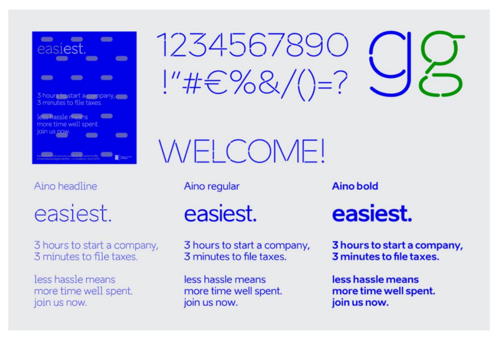
Figure 5: Estonia's own typeface, Aino