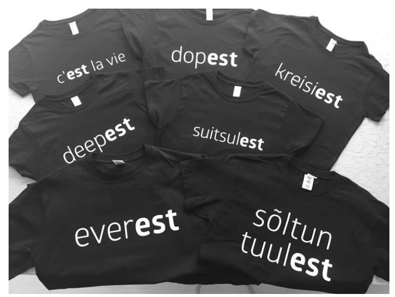
Figure 3: Examples of wordplays with the "est" syllable

Another "wordplay" and a part of the branding process according to the E-Stonia concept is that they ask people to create a link between positive and progressive words starting with the letter "e" and Estonia so that these e-words become synonyms for Estonia. A few examples can be seen in the table below. However, you can not only play with letter 'e' at the beginning of words: other examples reinforcing the concept of digital society and E-Estonia include "Why there's so many e letters is peer to peer?"