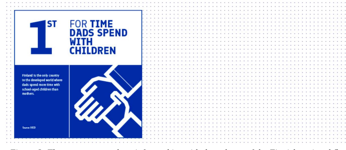
Figure 8: The country uses clean infographics with the colours of the Finnish national flag and a short piece of information – something in which Finland is a world leader or one of the best

In total, 53 graphics are available in the infographics section of Toolbox.finland.fi, 38 of which refer to some rankings – obviously ones where the Finns are the first or one of the best.