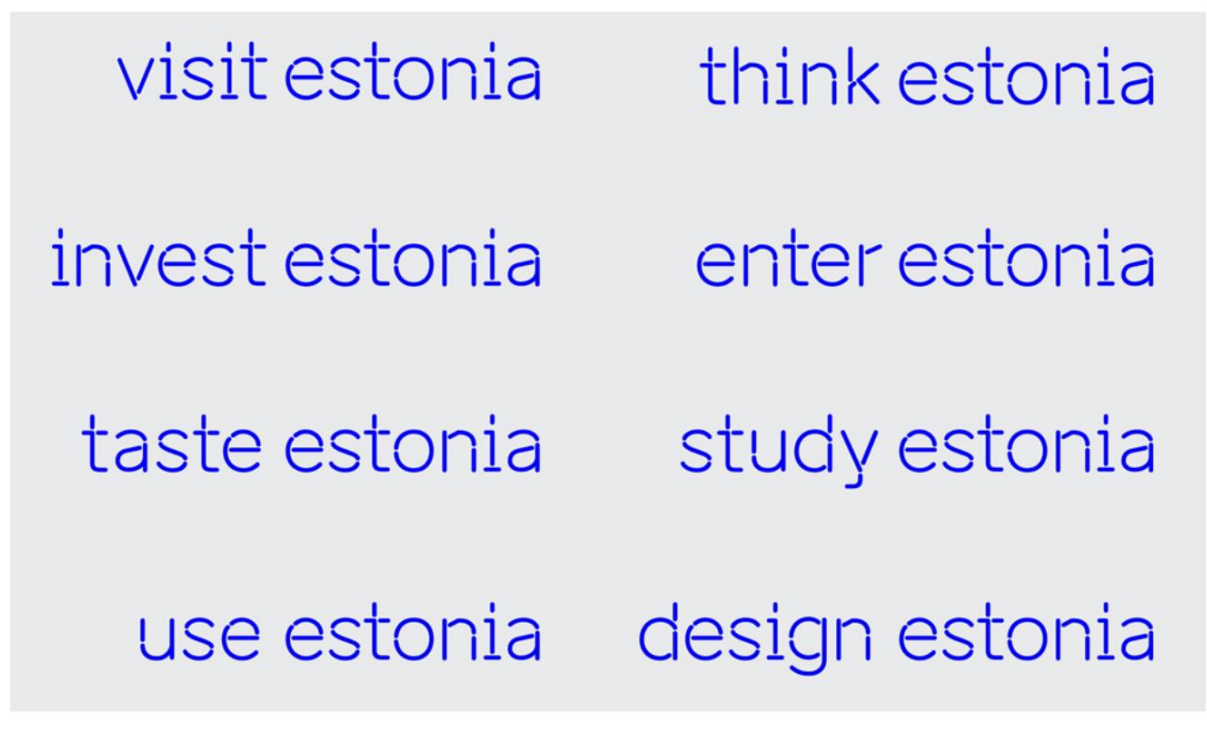
Figure 2: Wordmarks complement the use of the "country logo"

However, it is much more than visual identity. Estonia's digital country platform, brand.estonia.ee (2017) is an excellent example of a brand book, and how to build a country brand involving local citizens, facilitating uniform communications.